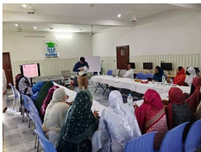
Teacher Training Session