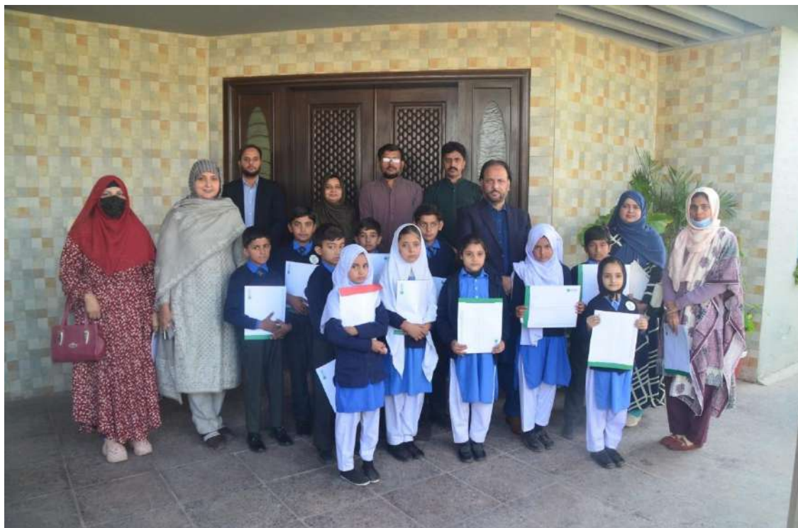
Bazam-e-Urdu Dubai competition Winner at RAHMA head office