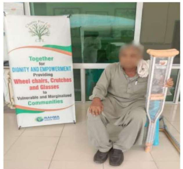
Wheel Chairs & Crutches Distribution