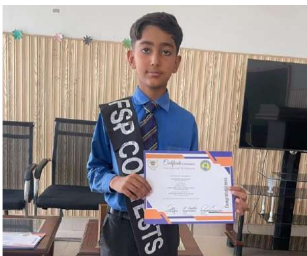
1 st position in the provincial level science competition across Punjab.