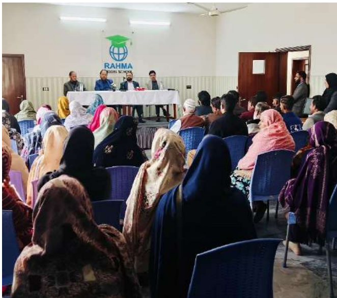
Parent Teacher Meeting