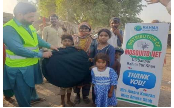
Distribution of Mosquito Nets