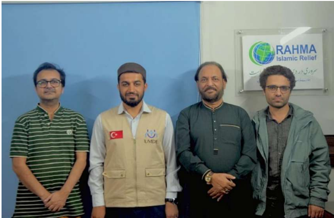
A delegation from UMDE Turkey visited the Head Office of RAHMA Islamic Relief Pakistan