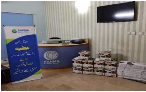
Distribution of Ceiling Fans