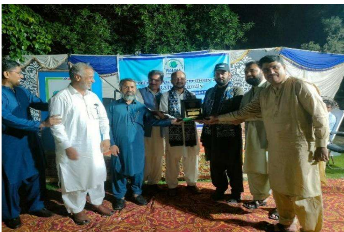
Annual Award Ceremony