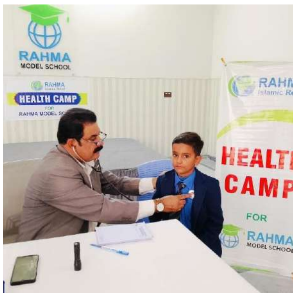
School Medical Camps