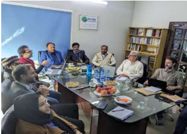
CISU Team visit, RAHMA Head Office