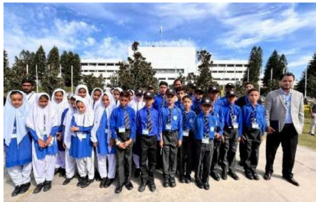
Parliament House Islamabad Visit