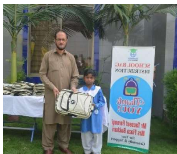
Distribution of School Bags