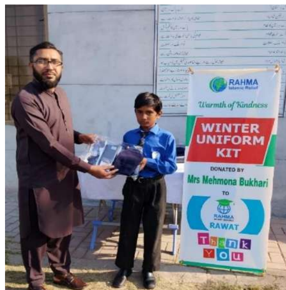
Winter Uniform Kits Distribution