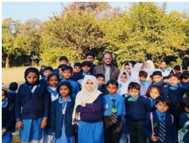
Trip to Ayub Park Rawalpindi