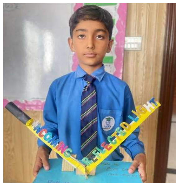
School Science projects