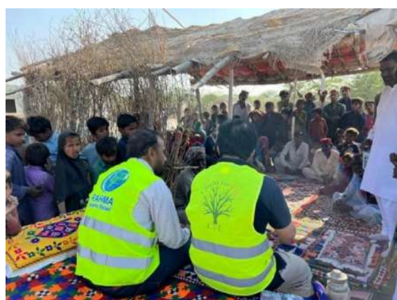
Community Awareness Session