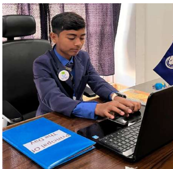
Principal of the Day