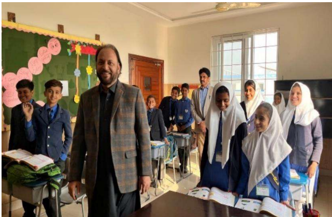
Chairman Rahma Islamic Relief visited Rahma Model School RYK