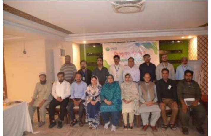
Progress & Planning Review Meeting