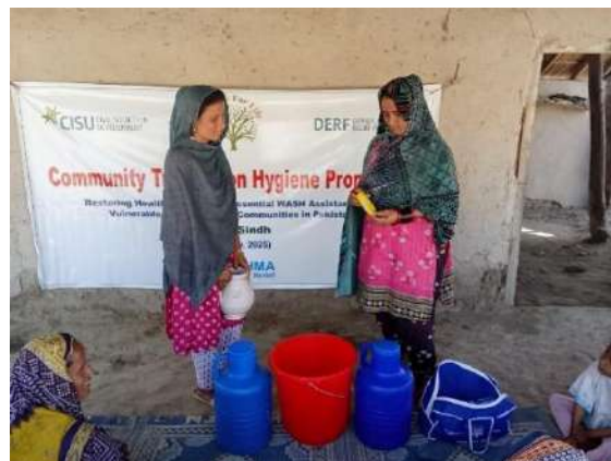
Distribution of Hygiene & Dignity Kits