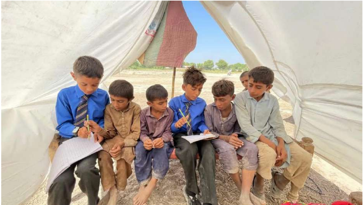
RAHMA students visited flood affected area