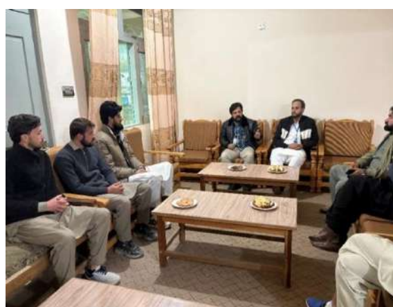
Volunteer Meeting in GB