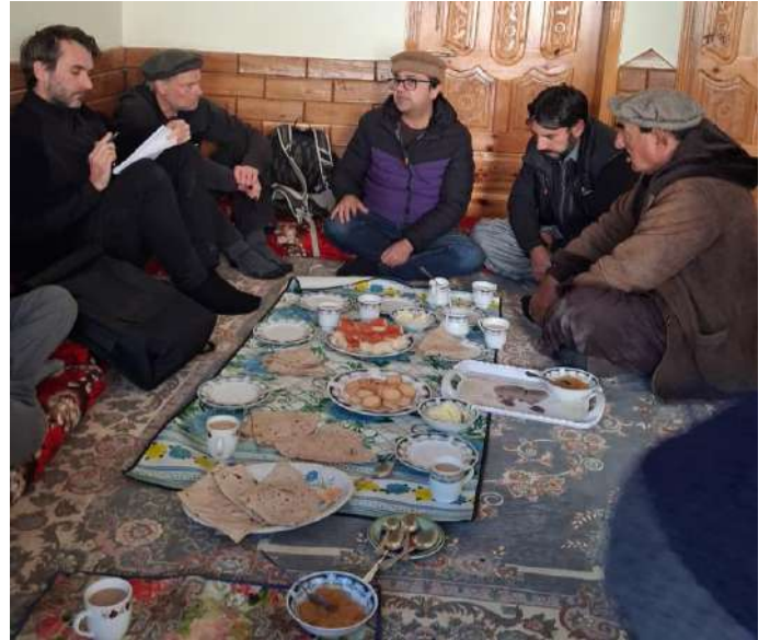
Community Meeting in GB