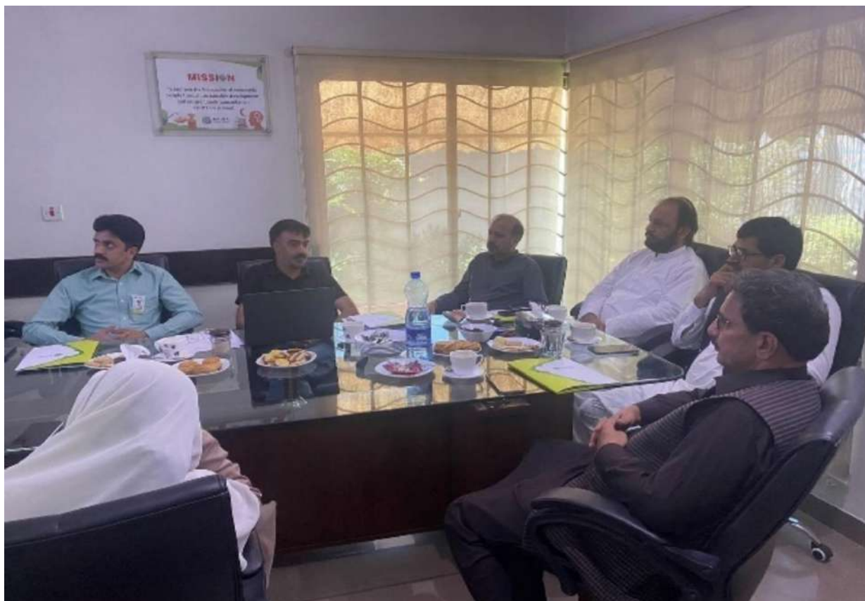
Annual Borad Members Meeting, Head office Rahma Islamic Relief