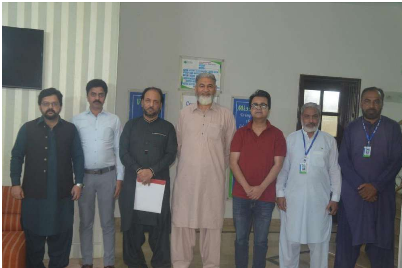
Chairman Pak Norwegian Welfare Foundation visited RAHMA office.