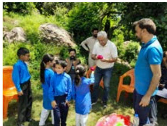
Children Welcoming Vice President, CFL