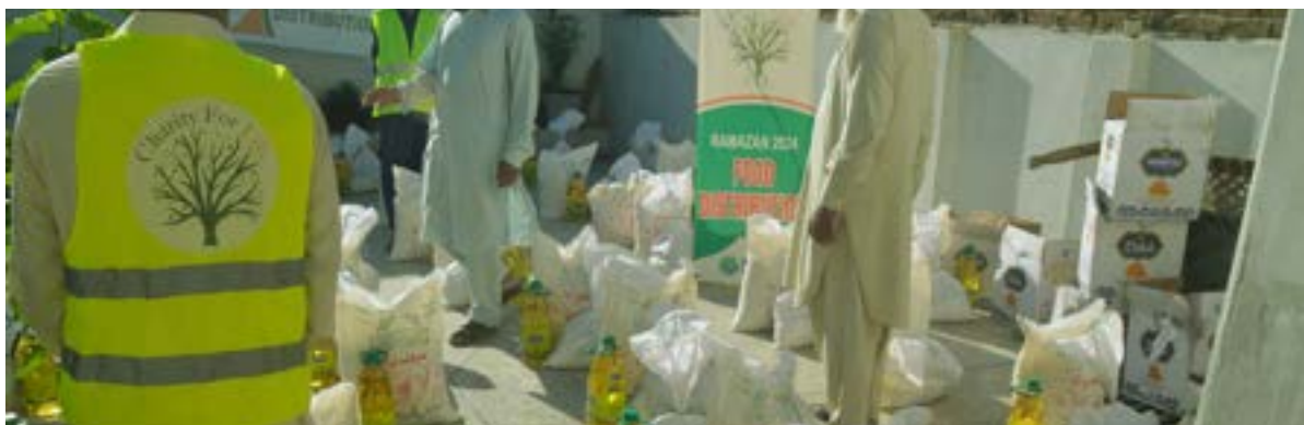
Food Distributions at Haveli, AJK