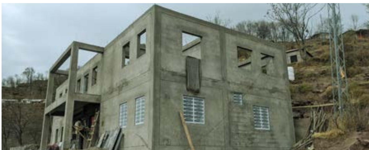
Construction of school: Work in progress