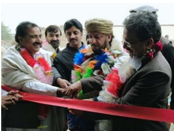
Inauguration ceremony of the project

RAHMA launched an initiative to reconstruct 100 houses (comprising one-room and two-room structures) for the most marginalized families in Rajanpur (Punjab) and Jaffarabad (Balochistan). The goal is to support flood-affected individuals who lost their homes by providing resilient, climate-adaptive housing solutions. Despite inconsistent funding and various challenges, RAHMA successfully completed the construction of homes for 100 flood-affected families in these regions during the reporting period.