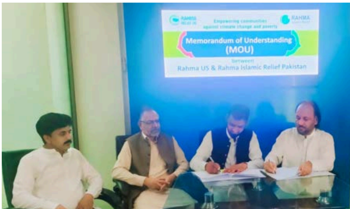
MOU with RAHMA Relief US: RAHMA Islamic Relief Pakistan signs MoU with RAHMA Relief USA, May 3, 2024