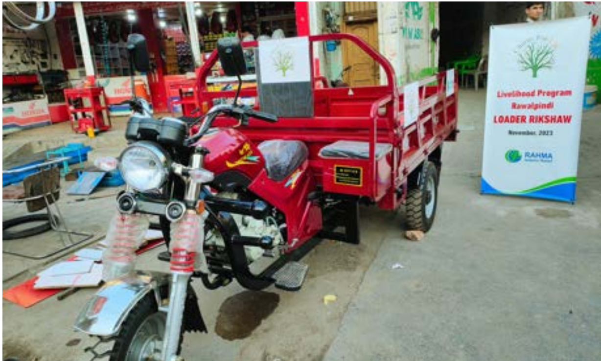
CFL and RAHMA started Livelihood ( Loader Rikshaw) Programme in Rawalpindi