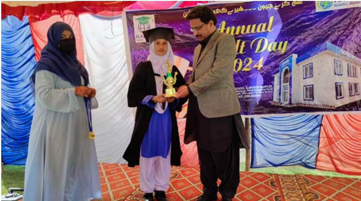
Annual day celebration