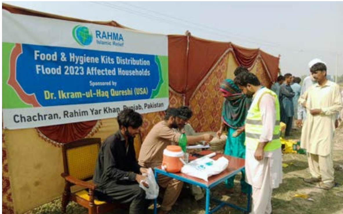
Food Distribution at Chachran village ,South Punjab