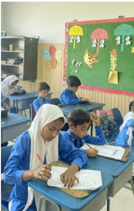
Participating in final exams