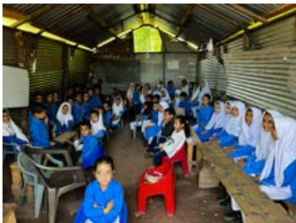
School in a hut since earthquake 2005