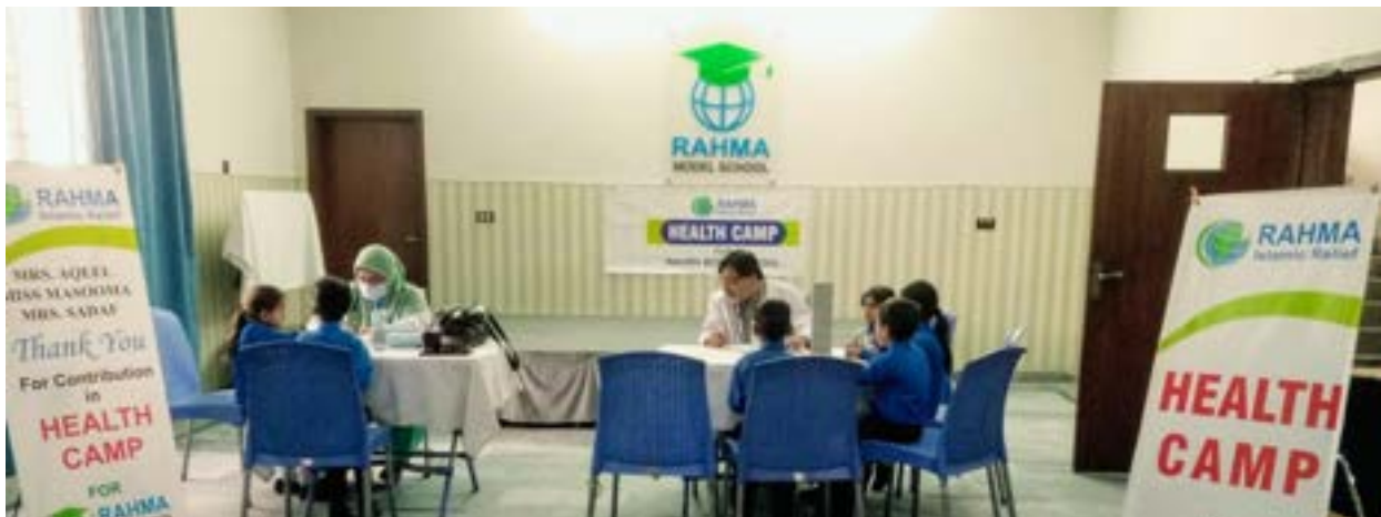
Health Screening of School Children