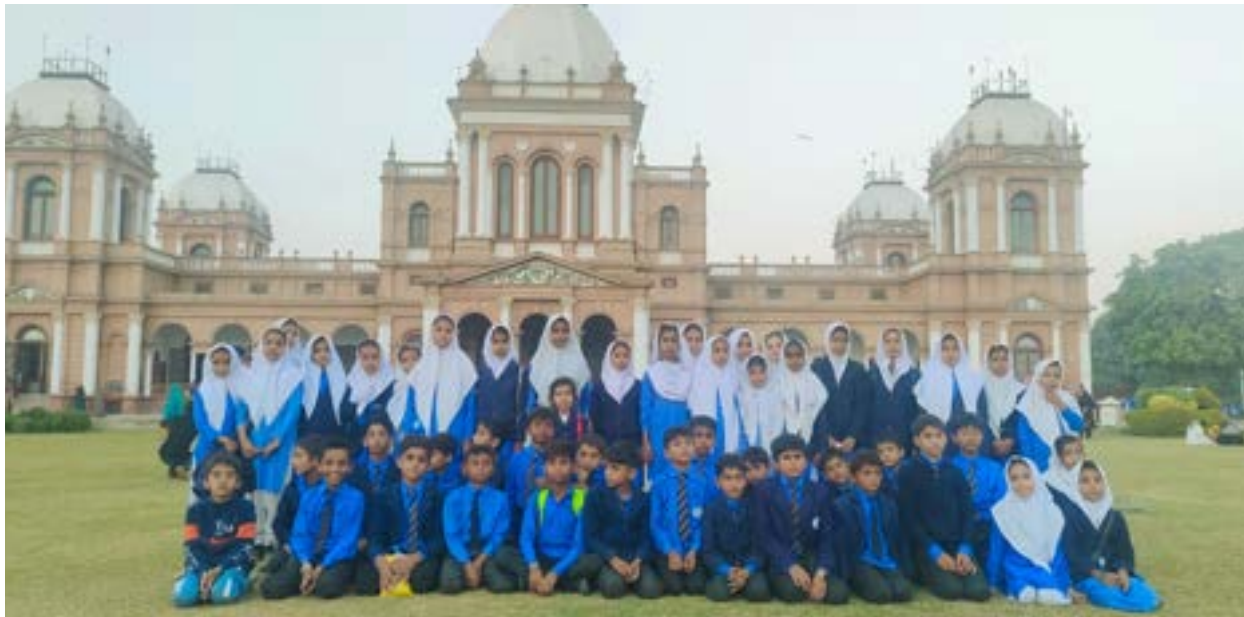
Recreational trip to Bahawalpur