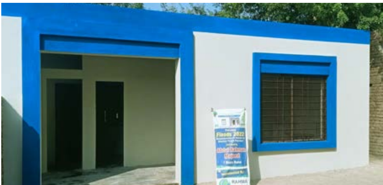
A newly completed house