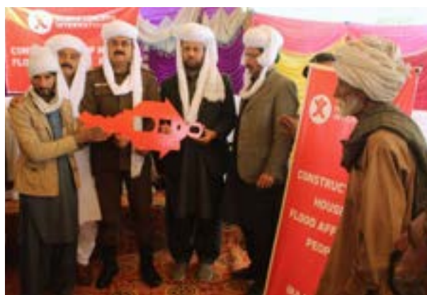
keys distribution ceremony, Rajanpur